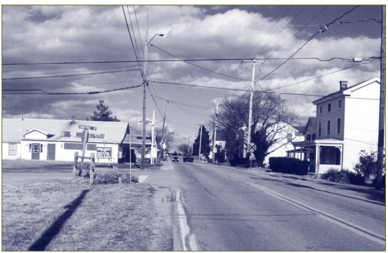
Illustration of streetscape and traffic calming improvements in Kennedyville.

improvements, the Alliance should focus energies in two areas: 1) working with MD SHA and localities to prepare bywaysensitive improvement plans, and 2) encouraging private owners to invest in improvements consistent with the overall vision and goals for the Byway.