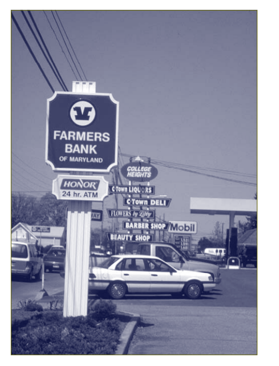
Commercial signs along MD Route 213 in Chestertown.

Providing ways to travel between sites, whether by foot or car, also helps improve conditions on the main road. Rather than reenter the road to drive from one site to the next, patrons could walk from business to business or drive between them without entering the main stream of traffic. This could greatly improve driving conditions for those unfamiliar with local conditions. Tourists also tend to be more likely to use sidewalks in these circumstances, so it could prove beneficial for both residents and visitors, and for neighboring businesses to provide these connections.