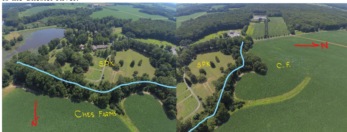
Lower Stream – to St Pauls Mill Pond Rd of West Branch Langford Creek)

This RFP concerns the second of a 2-phase project intended to restore and enhance the stream system of an unnamed stream, approximately 1,250 feet in length, (identified in the aerial photos below by a blue line under a tree line extending from Sandy Bottom Road east, to St Paul's Mill Pond). It is the confluence of drainage ditches along both sides of Sandy Bottom Road, making the flow particularly strong during rain events, and less so during dry months. (It is therefore considered "perennial".) The surge is further increased by drainage from a Chesapeake Farms field directly to the north of the stream, which concentrates in a natural depression and flows into the stream at its midpoint. All this causes notable erosion of the banks, and nutrient runoff from surrounding farmlands into the drainage ditches, depression, and finally the stream (see "Stream Drainage Area" photo below). The result is 1) The stream has moderately-to-severely incised banks that are creating high sediment loads downstream. 2) The stream banks have been encroaching on the Church Cemetery land where there are headstones. 3) Significant sedimentary and nutrient flow carries into receiving waterways, namely the "Saint Paul Branch" tributary (Use I) of West Langford Creek (Use II). Langford Creek is one of the main tributaries to the Chester River.